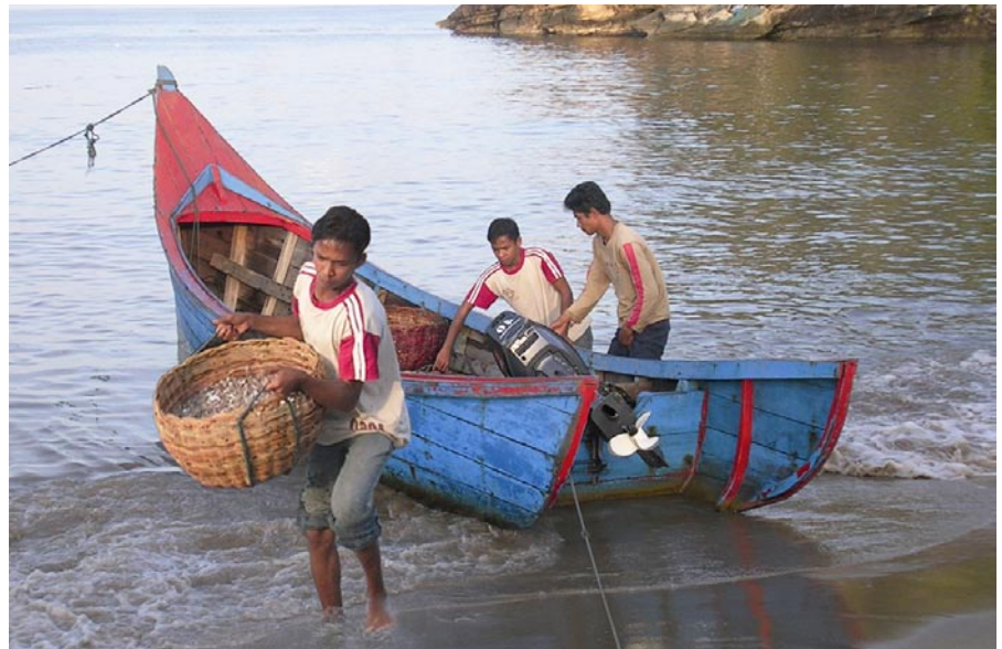
African and southeast Asian countries are the most economically vulnerable to climate change impacts on fisheries resources.

Here we identify four key areas where policy responses and associated research are needed, and we call upon delegates and decision-makers participating in the UN Framework Convention on Climate Change process to take these on